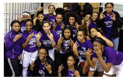
Obama Academy - Girls City Champs