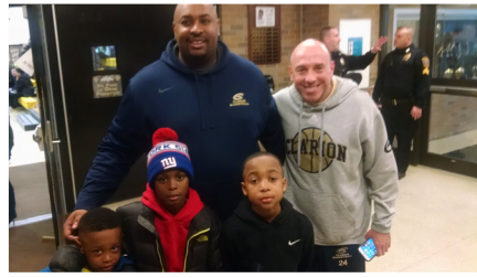
Clarion University coaches with ASP kids