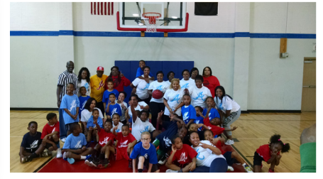
9 & Under vs Mom's game