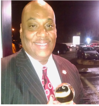
Men's Challenge Community Service Award