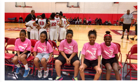
5th grade girls playing in tournament at Duquesne University.